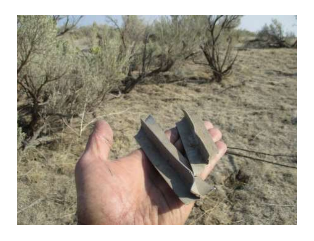
Pieces of stringers from the aircraft's framework