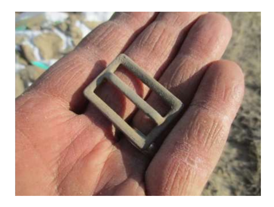
A small buckle