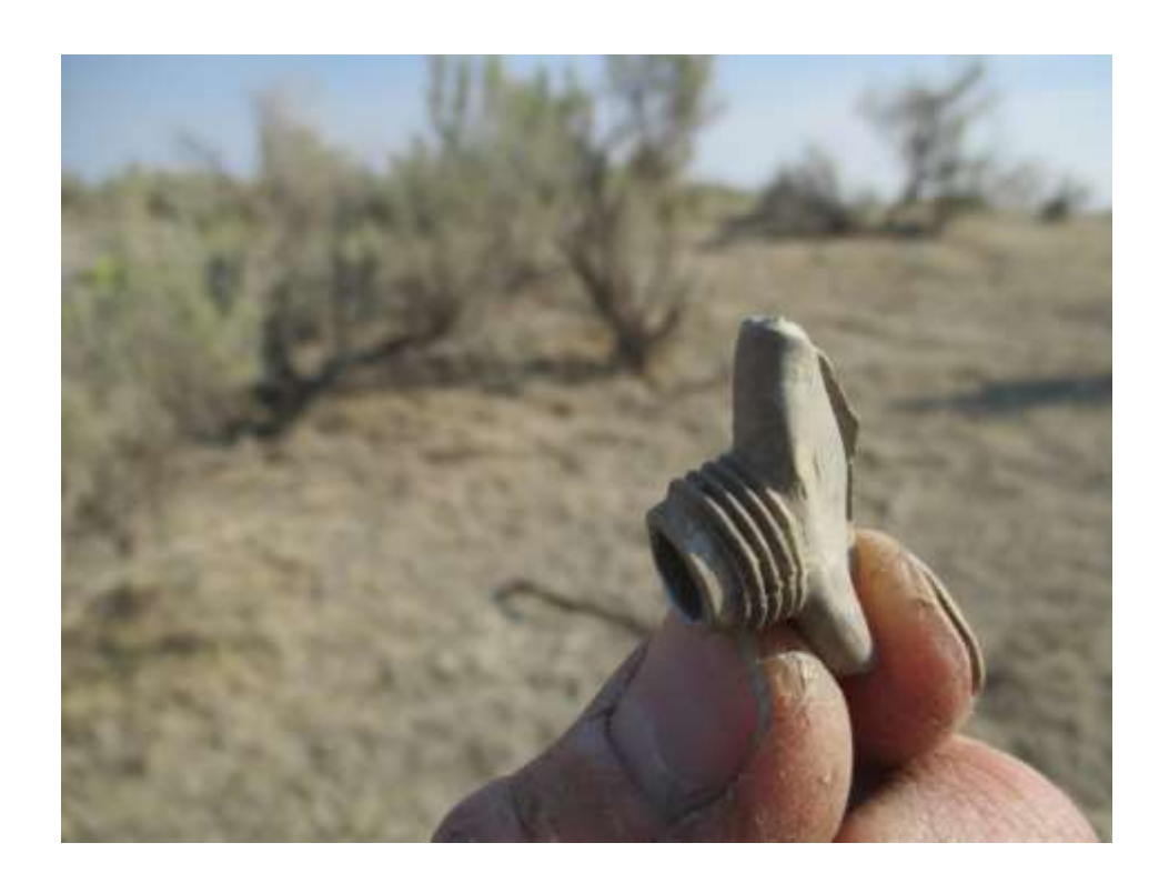
The top of a toothpaste tube