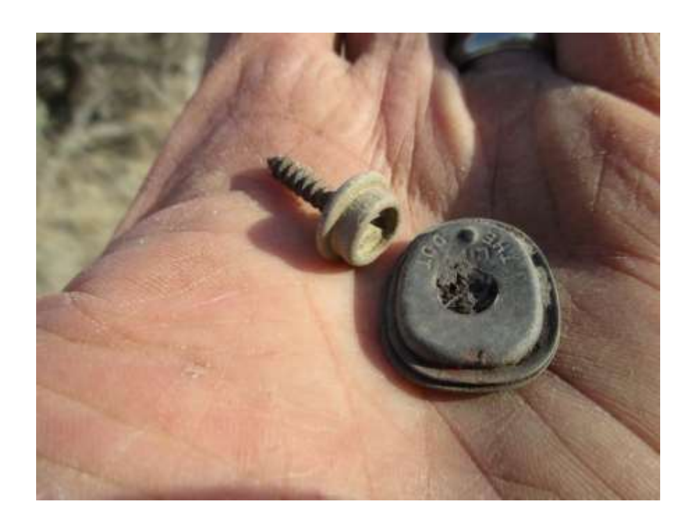
Many small fasteners were found