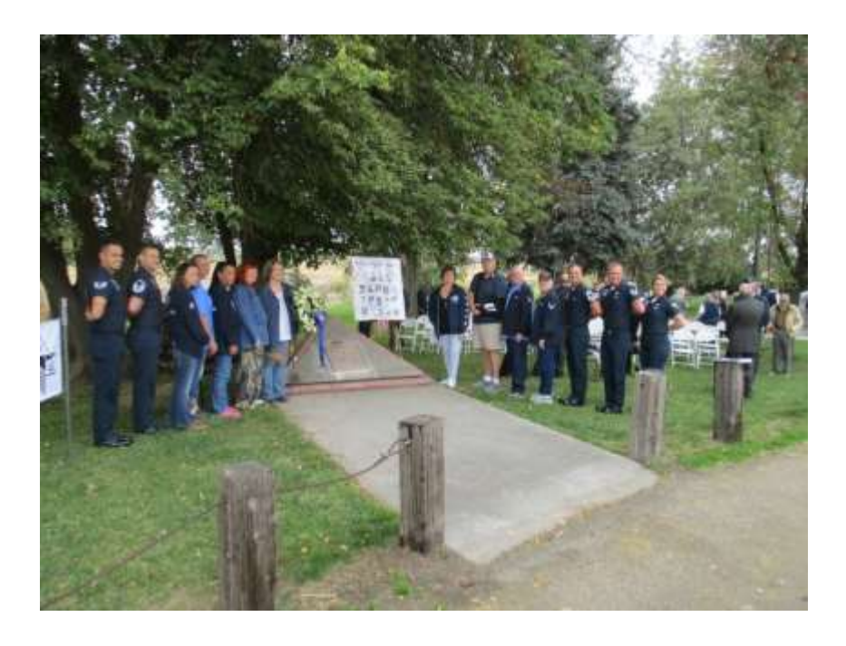
Relatives and Thunderbirds representatives stand in front of the monument