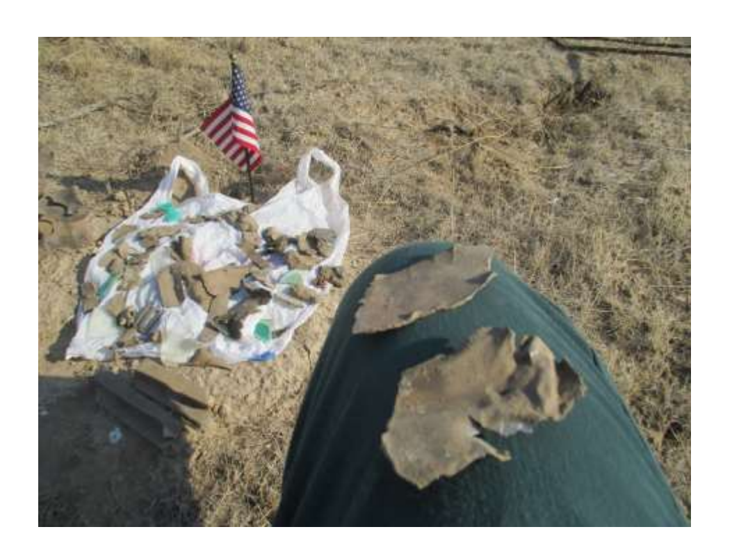
Various small pieces