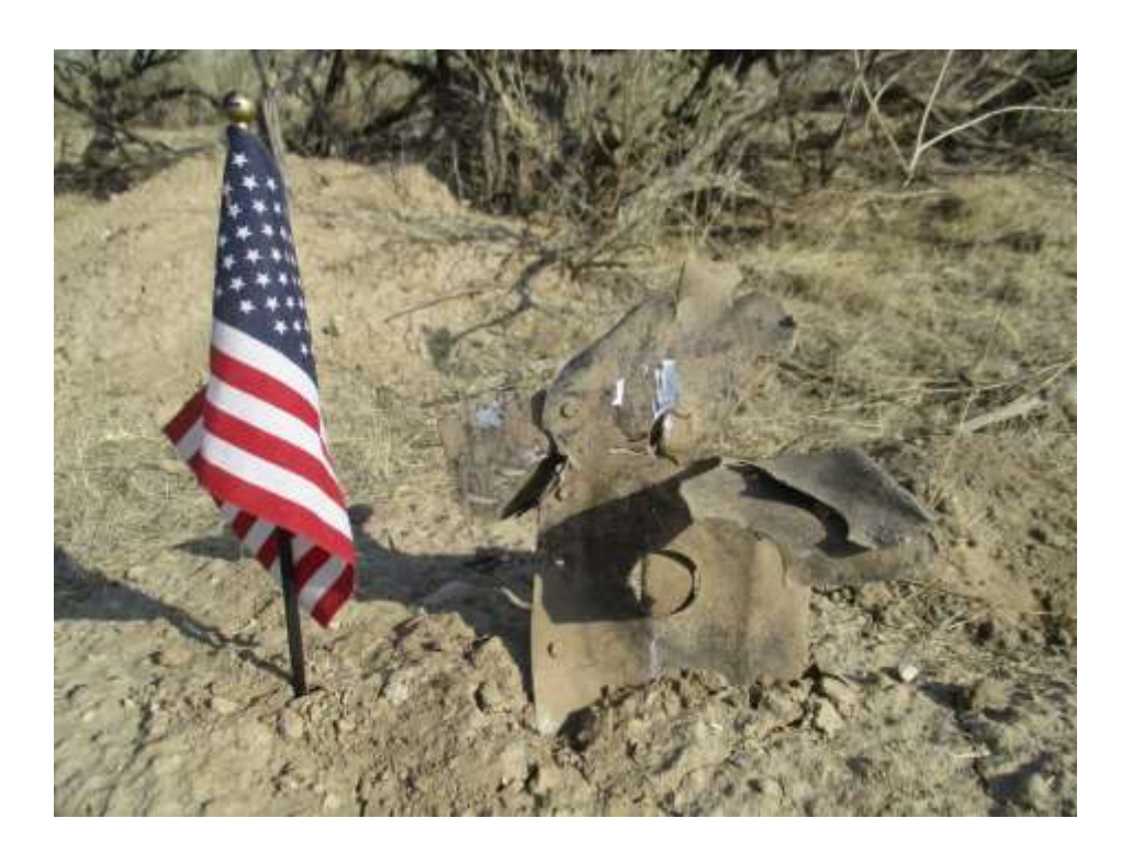
The largest piece that was located