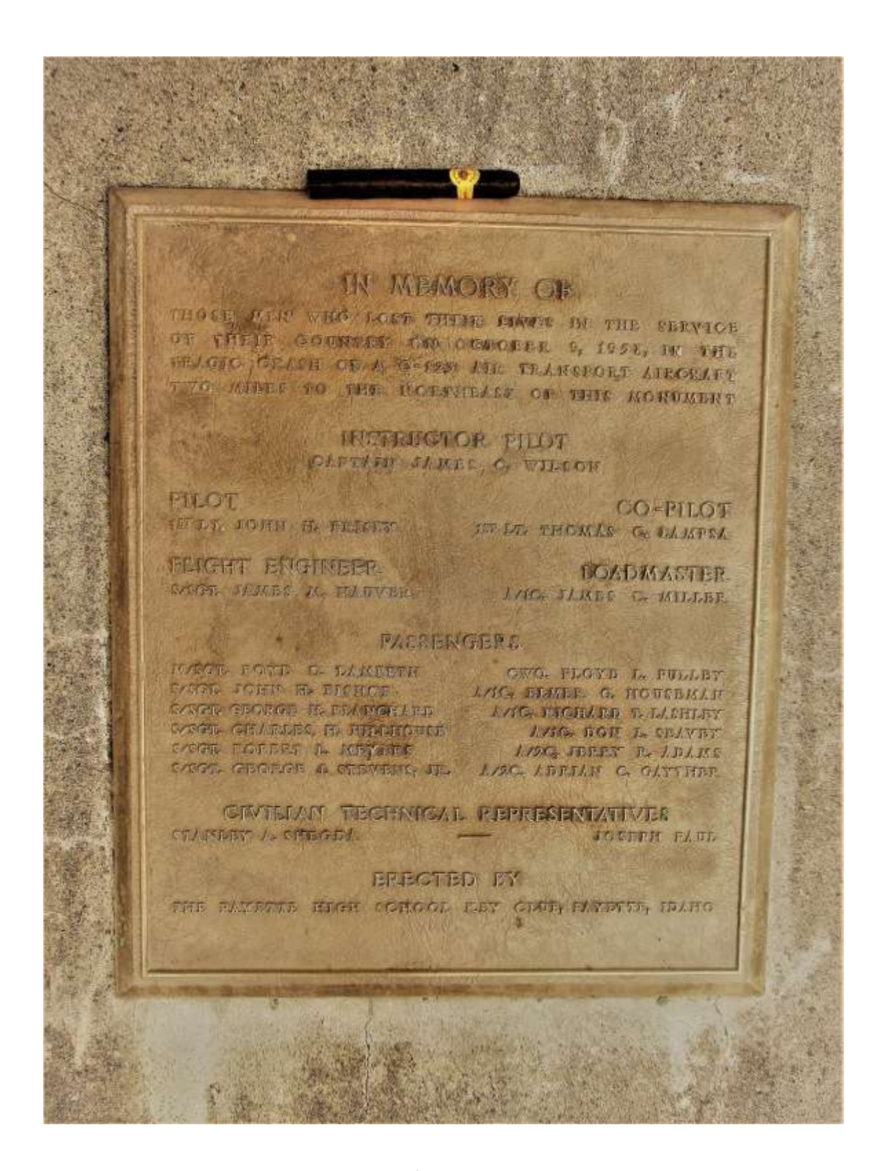
The monument plague with names of the 19 men killed on #55-4521A