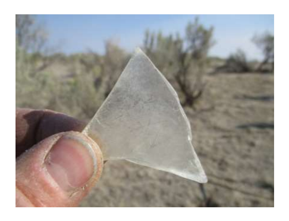
The telltale piece of plexiglass on the surface that marked the crash site