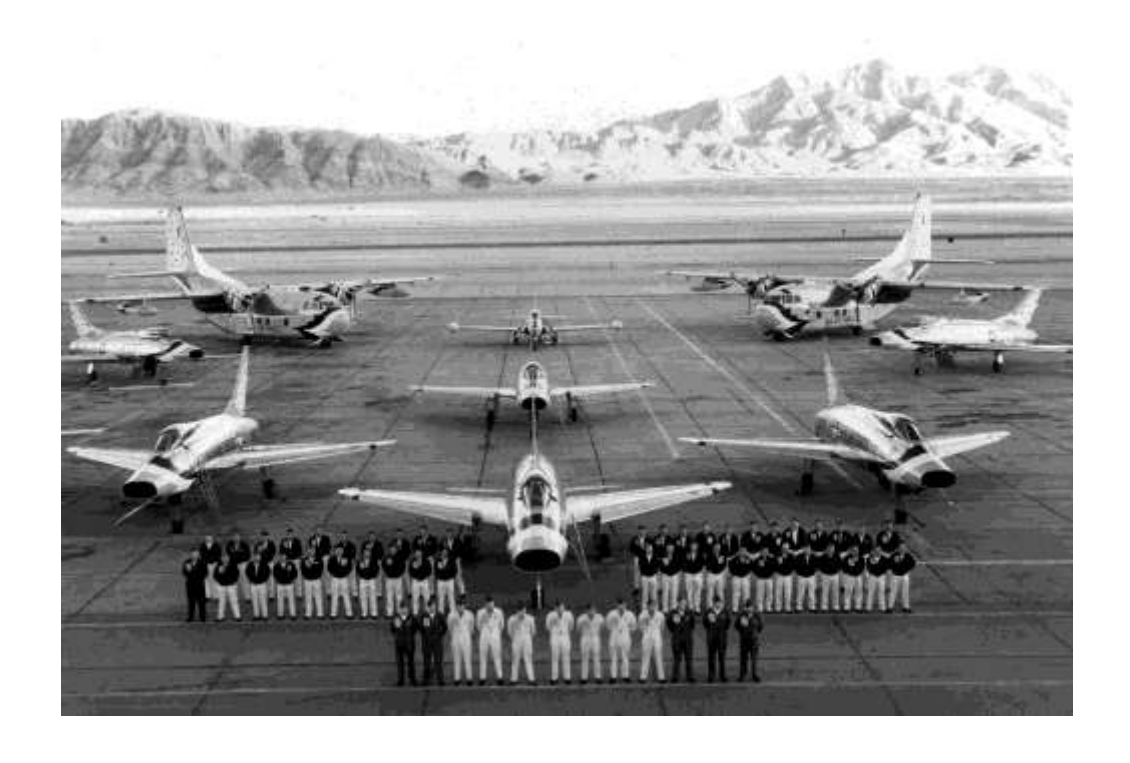
1958 Thunderbirds publicity photo with C-123 aircraft in the background, taken at Nellis AFB, Nevada