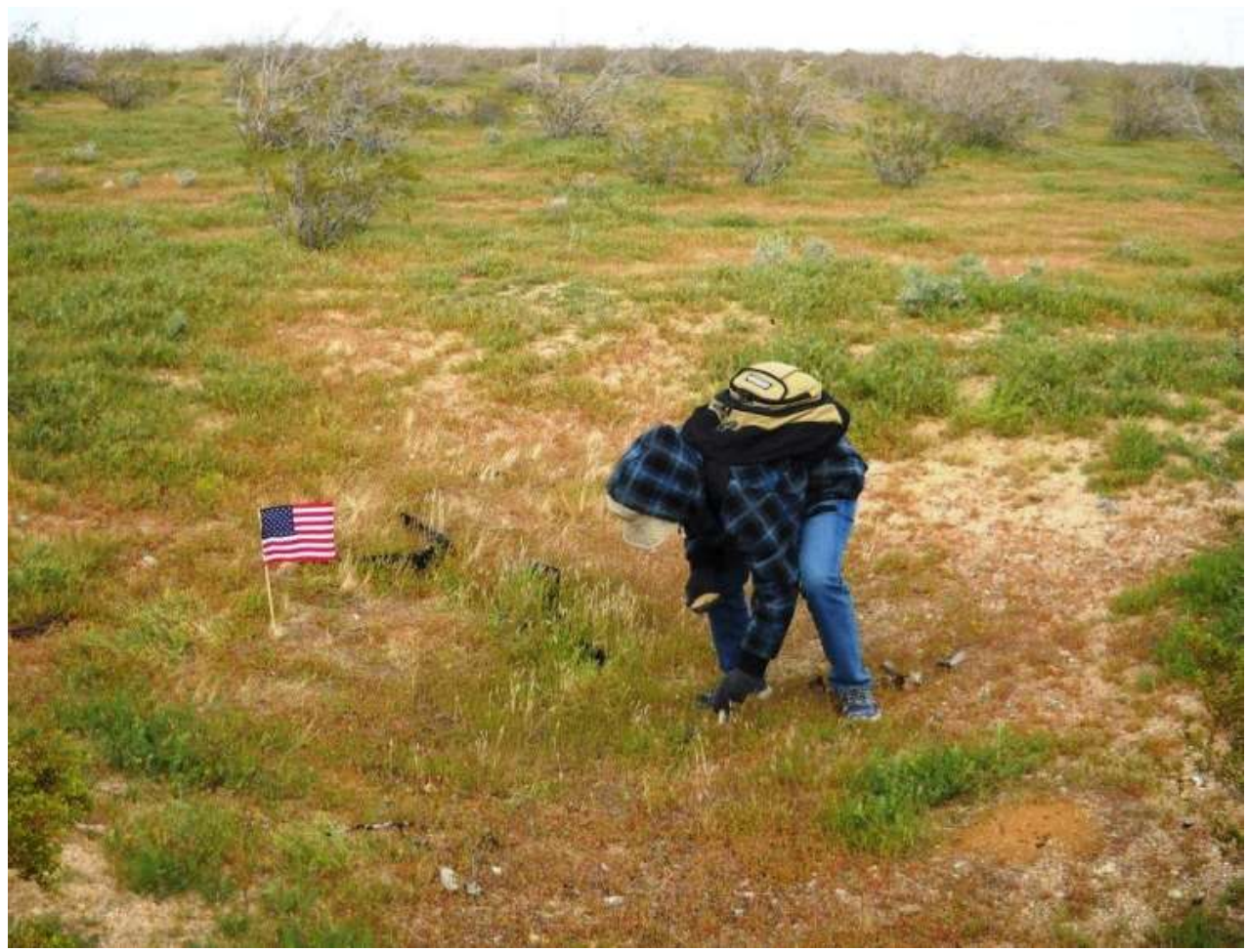
As I hiked across the desert I noticed a small indentation in the desert floor of about a foot in depth. The indentation was the impact crater from the crash that has filled in over the decades. Surrounding the "crater" were small pieces of aircraft wreckage.