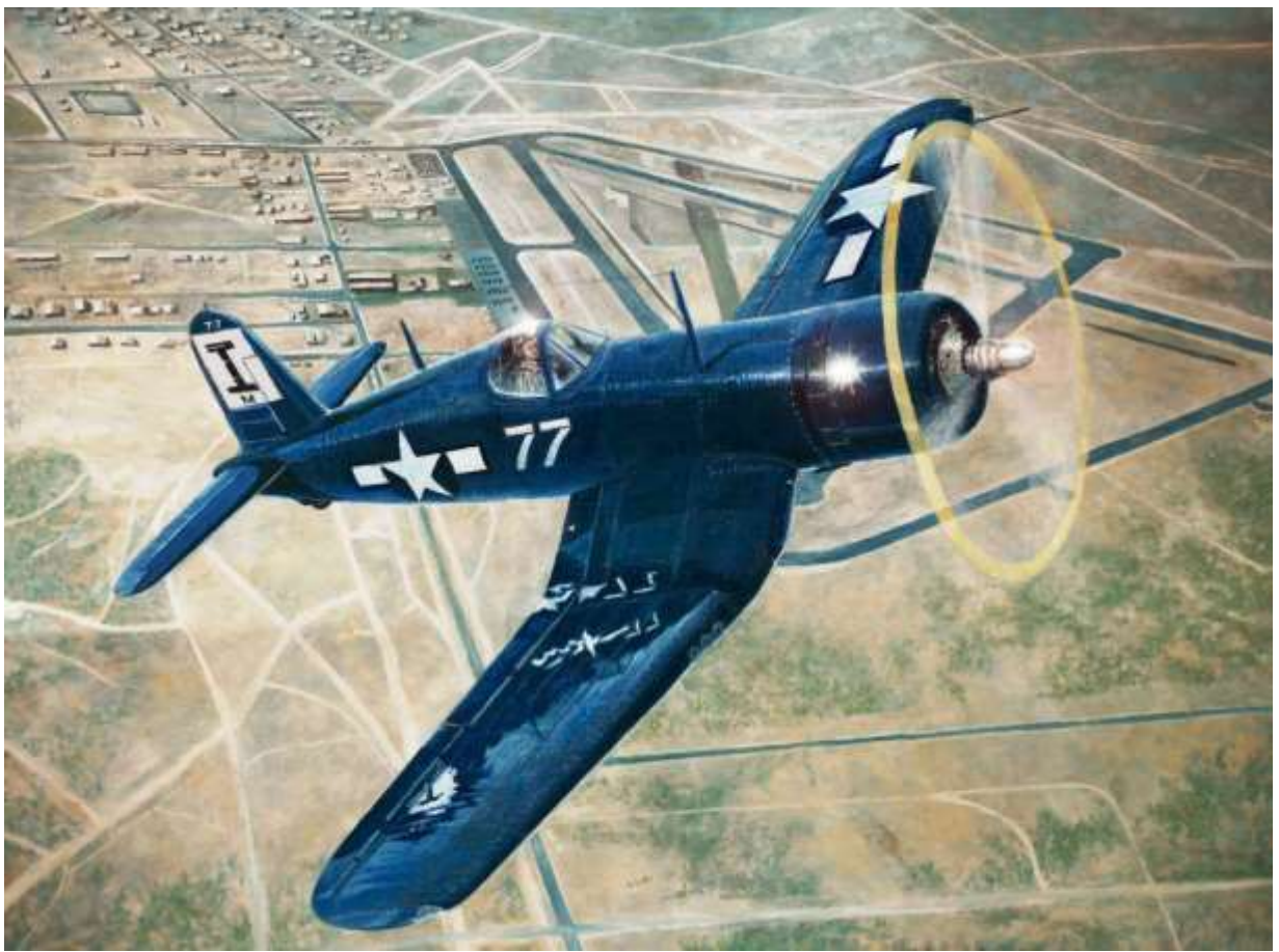
F4U Corsair over MCAS Mojave painting by Douglas Castleman

corrected the trouble with the aircraft flipping over onto its back. Captain Shaw had 164 hours in Corsairs during the last three months with a total of 1146 hours in the type. The total time on Corsair #17936 was 551 hours.