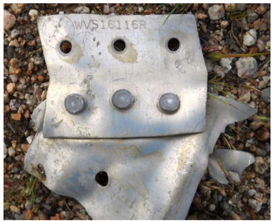
I was able to identify and verify the wreckage as coming from a Vought Corsair by finding part numbers starting with "VS".