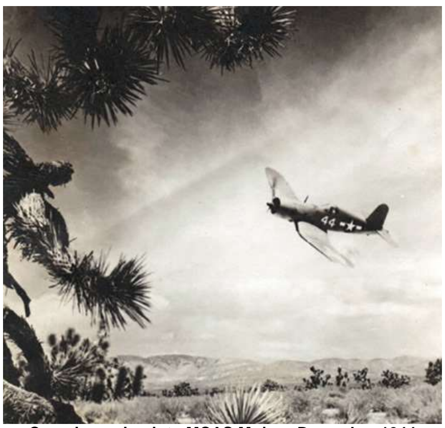
Corsair coming into MCAS Mojave December 1944

Training at MCAS Mojave was not without costs. There were at least 144 Corsair training accidents related to MCAS Mojave during WWII. The Corsair accidents are broken down as follows: 65 FG-1 accidents, 63 F4U-1 accidents, and 16 F3A accidents all from Corsair aircraft assigned to MCAS Mojave.