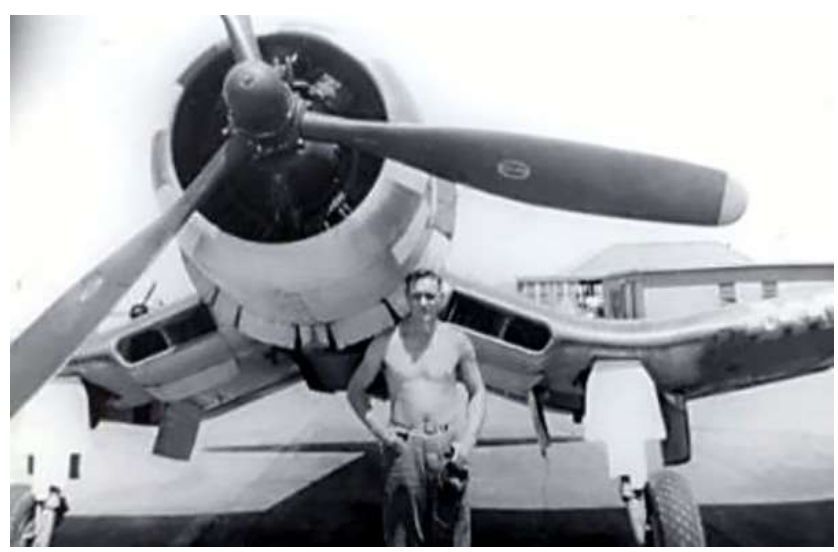
VMF 124 Corsair and mechanic at MCAS Mojave

MCAS Mojave became one of the main training centers for Marine squadrons slated for assignment aboard aircraft carriers. The squadrons at MCAS Mojave flew all the Corsair variants including the F4U, FG, and F3A versions. Mojave was an excellent training facility. The desert location provided VFR flying conditions most of the time, noncongested airspace, and nearby bombing and gunnery ranges. VMF-213's stateside training at MCAS Mojave was rigorous. Squadron training included division tactics, navigation, bombing, gunnery and field carrier landing practice. Pilot training consisted of test hops, night flying, cross country, navigational hops, and a lot of ground support missions with the 5th Marines at Camp Pendleton. During June 1944, they set a new daily record for Marine West Coast fighter squadrons by flying 272.2 hours with the squadron's 21 Corsair aircraft, which averaged 13 hours each.