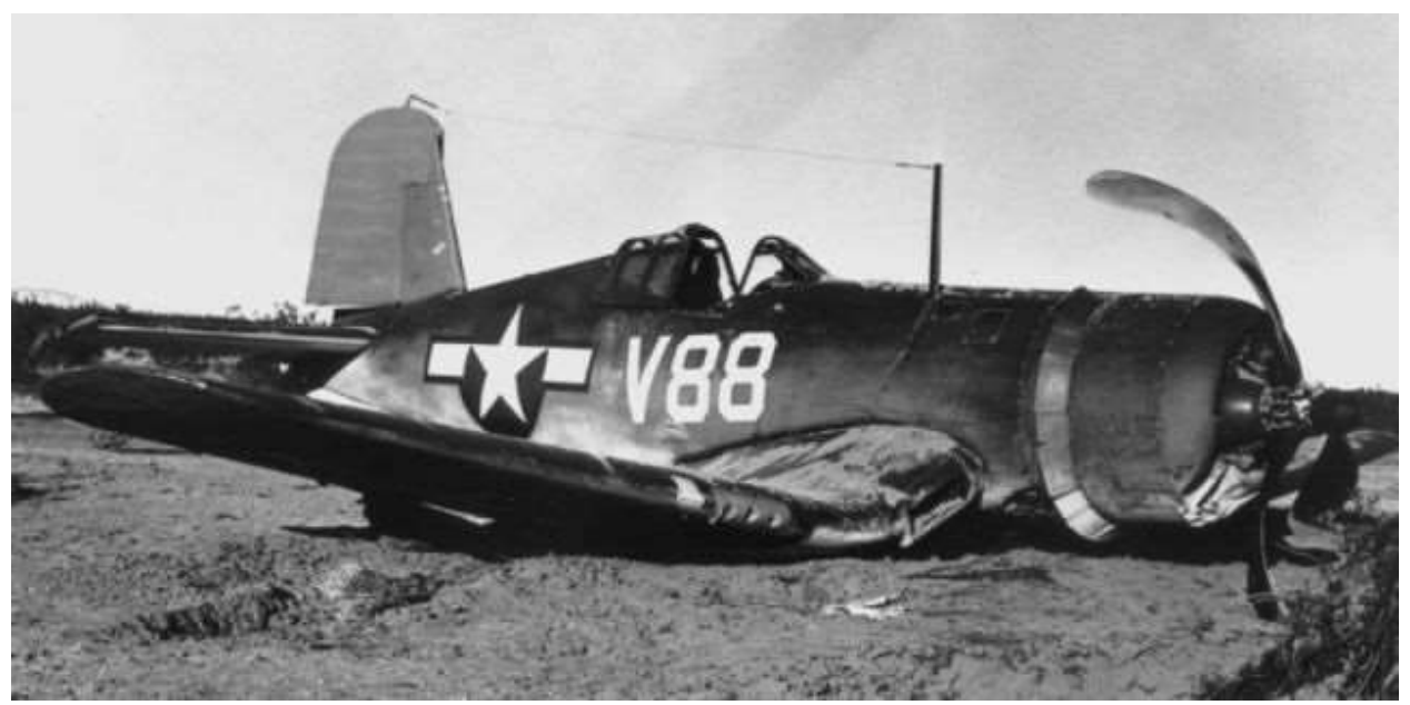
F4U-1 #02721 from VMF-121, training accident at MCAS Mojave, Dec 26 1943

Training at MCAS Mojave was not without costs. There were at least 144 Corsair training accidents related to MCAS Mojave during WWII. The Corsair accidents are broken down as follows: 65 FG-1 accidents, 63 F4U-1 accidents, and 16 F3A accidents all from Corsair aircraft assigned to MCAS Mojave.