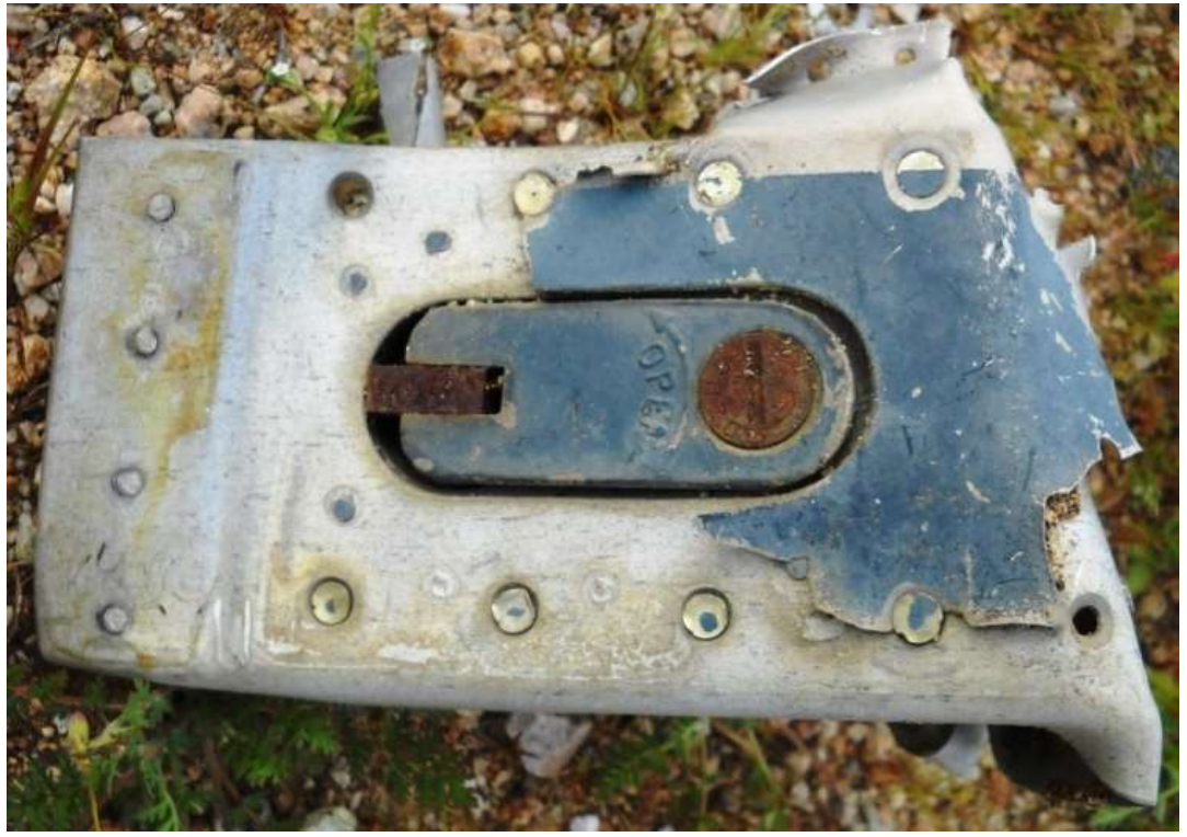
Also discovered were parts with faded blue paint color. The paint color was consistent with the Corsair paint color at MCAS Mojave.