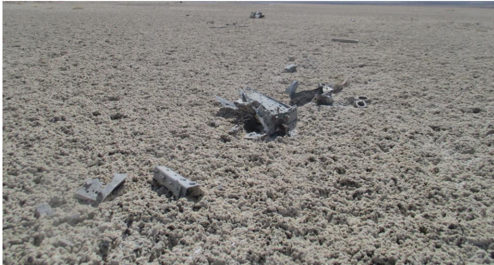
Wreckage strewn across the salt flats