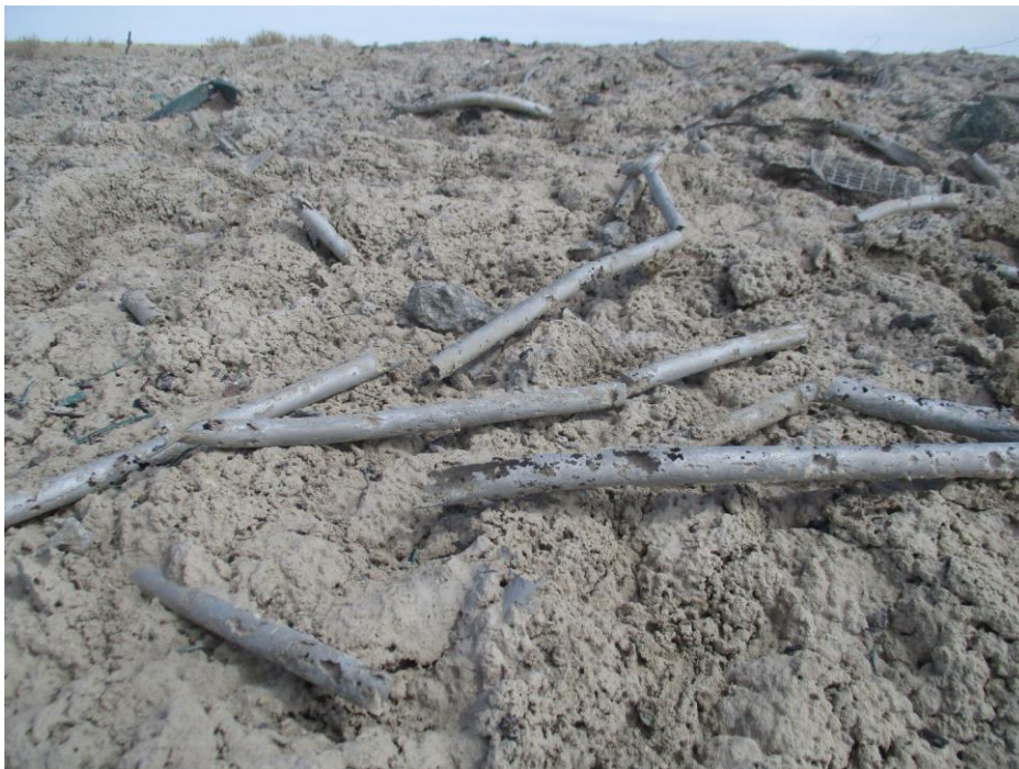
Lots of corroded aluminum tubing at this site