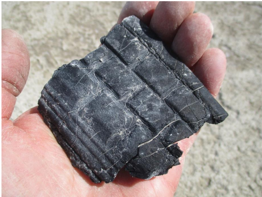
Piece of front landing gear tire