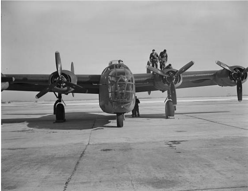
A Consolidated B-24E similar to #42-7090