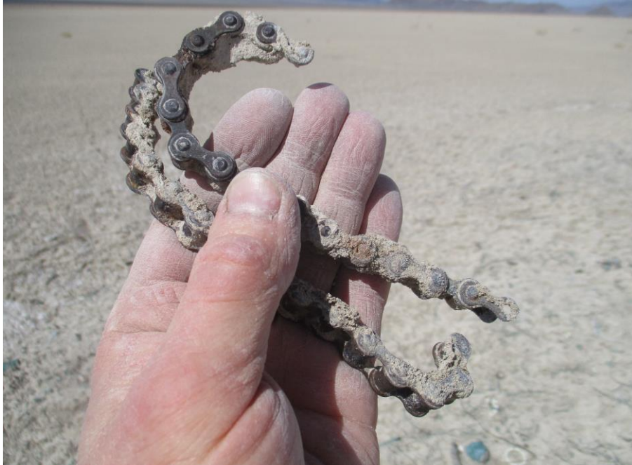
Part of a chain from flight controls