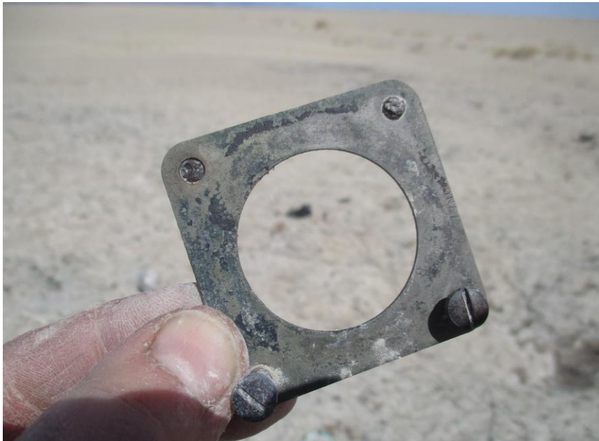
Bezel from a cockpit switch