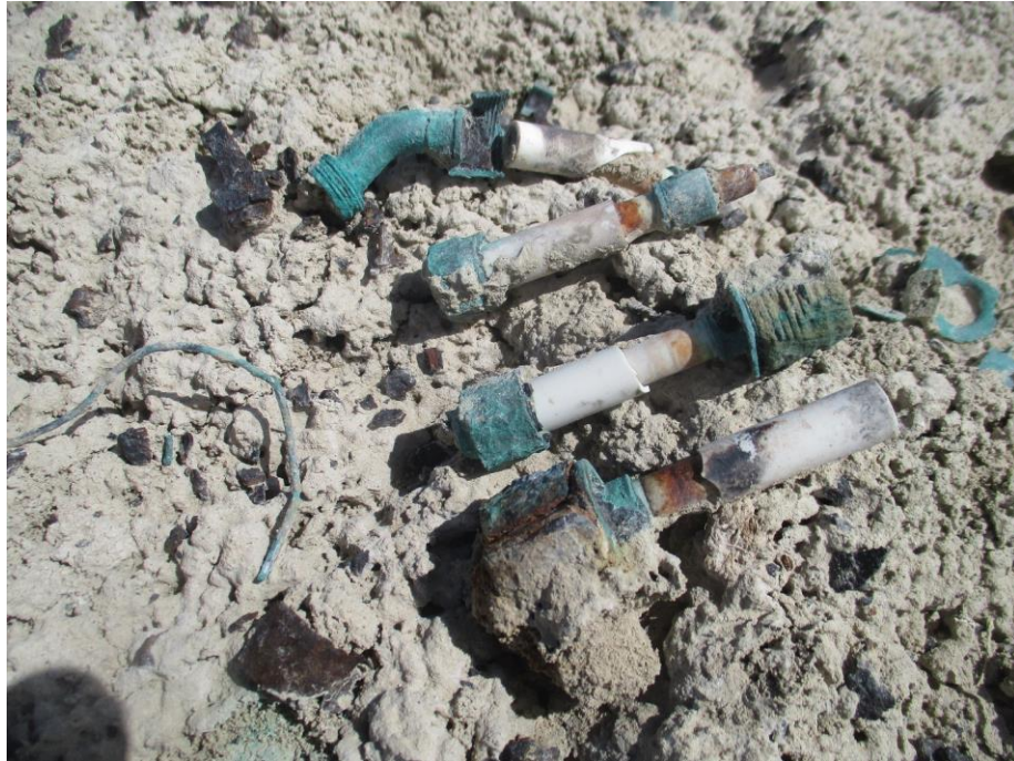
Melted spark plugs with only the center electrodes and ceramic insulators remaining