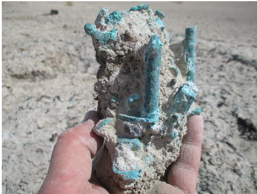
Part of a magneto