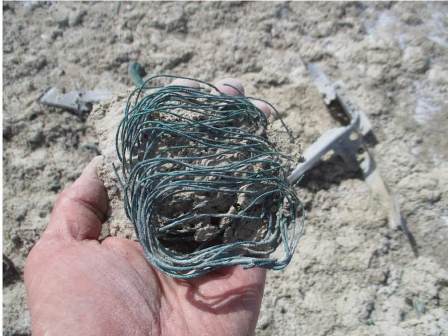
Lots of electrical wiring at this site