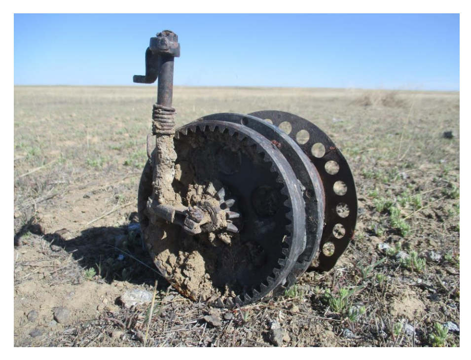
A large geared piece of equipment