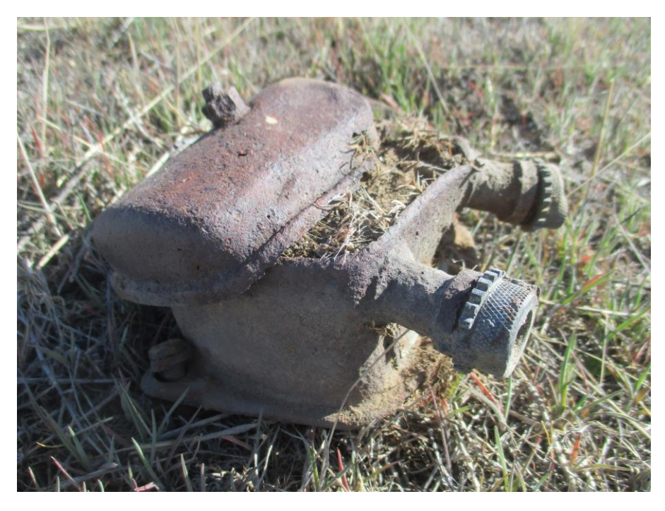
Part of a bomb sight