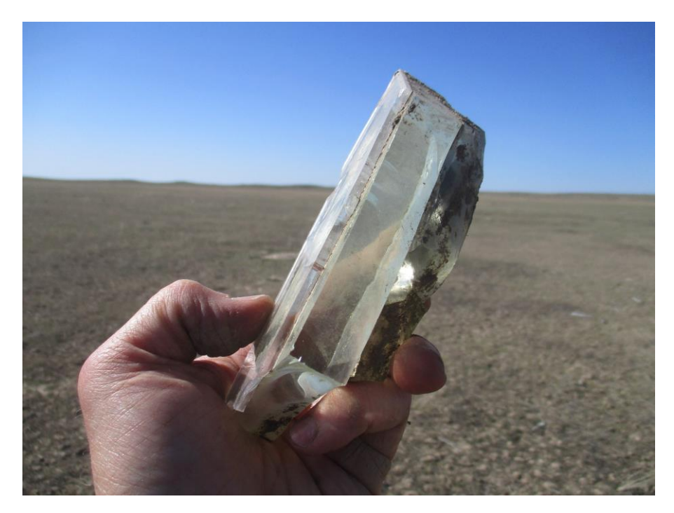
A chunk of thick plexiglass