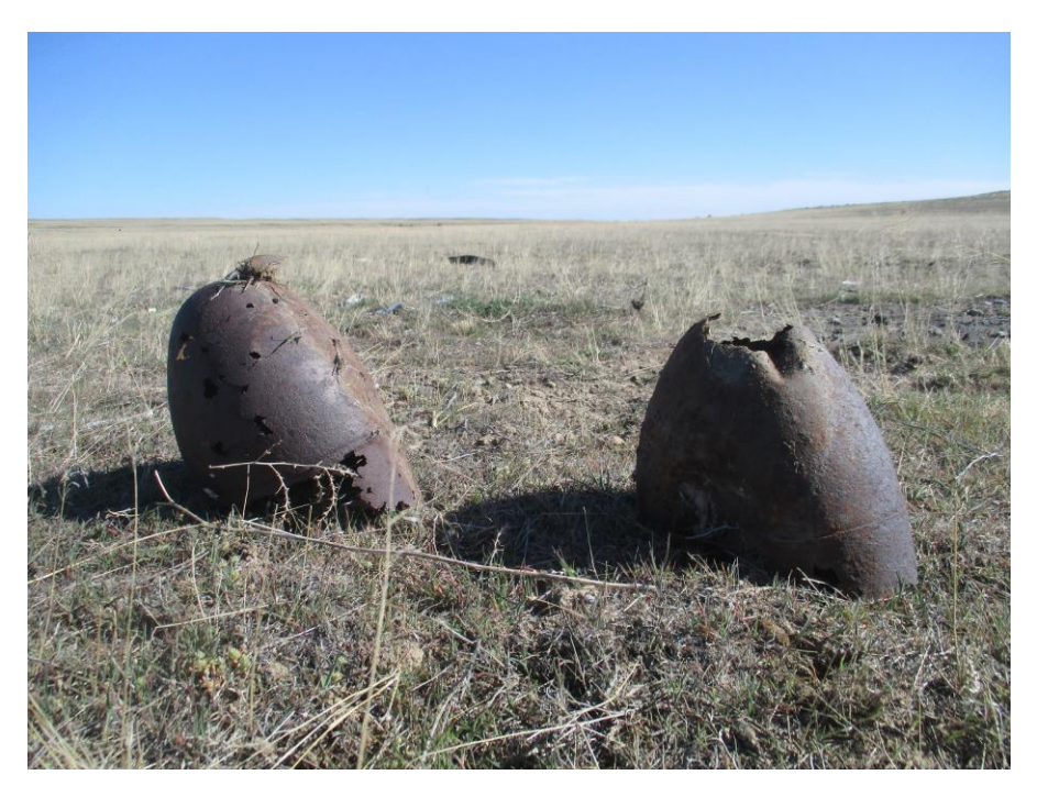
The noses of two practice bombs