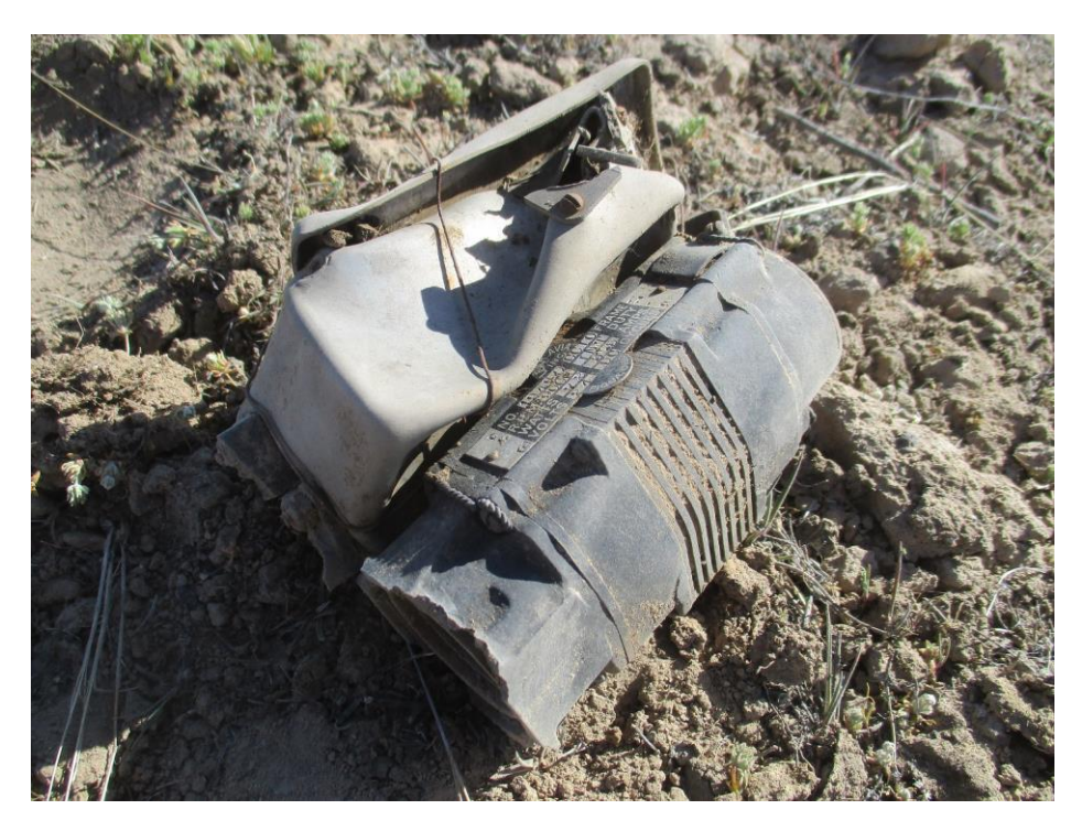
A Lear Avia electric motor used for opening and closing landing gear doors