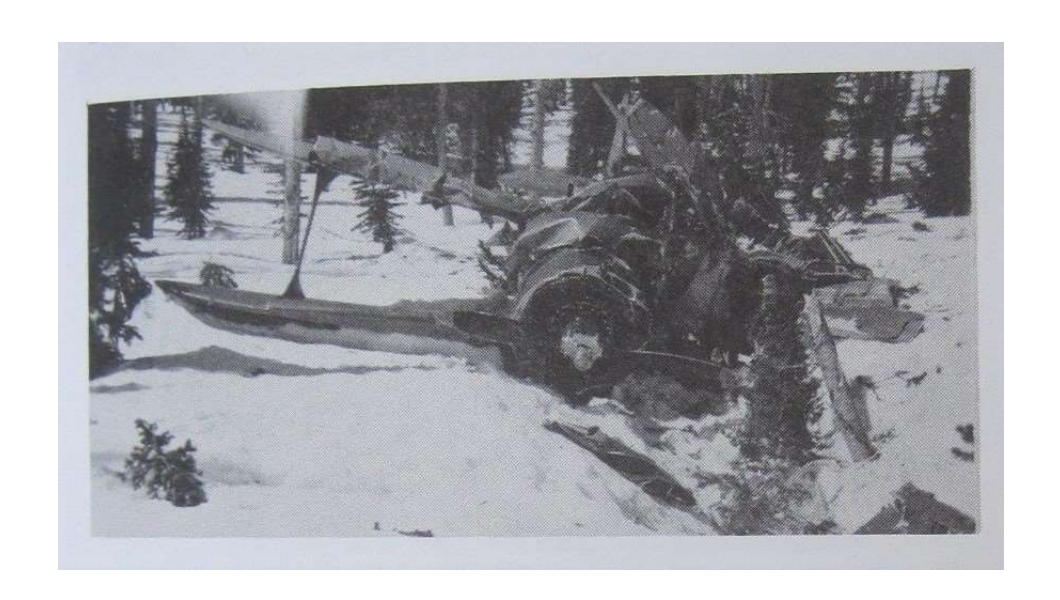
A view of #42-38231 shortly after the crash