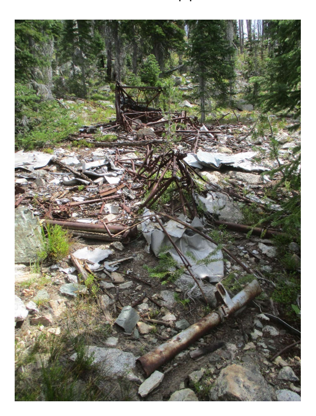
Another view of the crash site