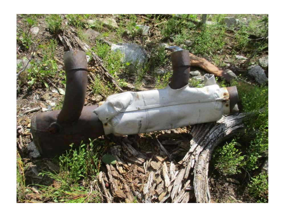
An exhaust pipe