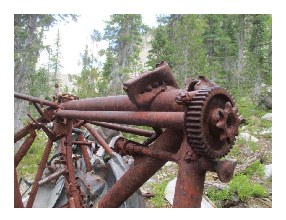
Sprockets, gears and chains associated with the cockpit controls