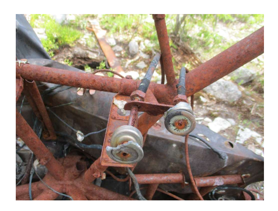
A pair of cockpit controls, with the co-pilot's rudder pedals visible at lower left