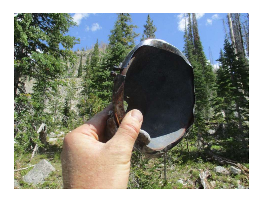
A landing light