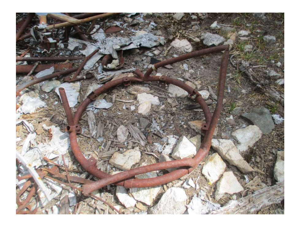
Part of the engine mount