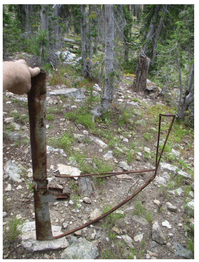
Part of an elevator