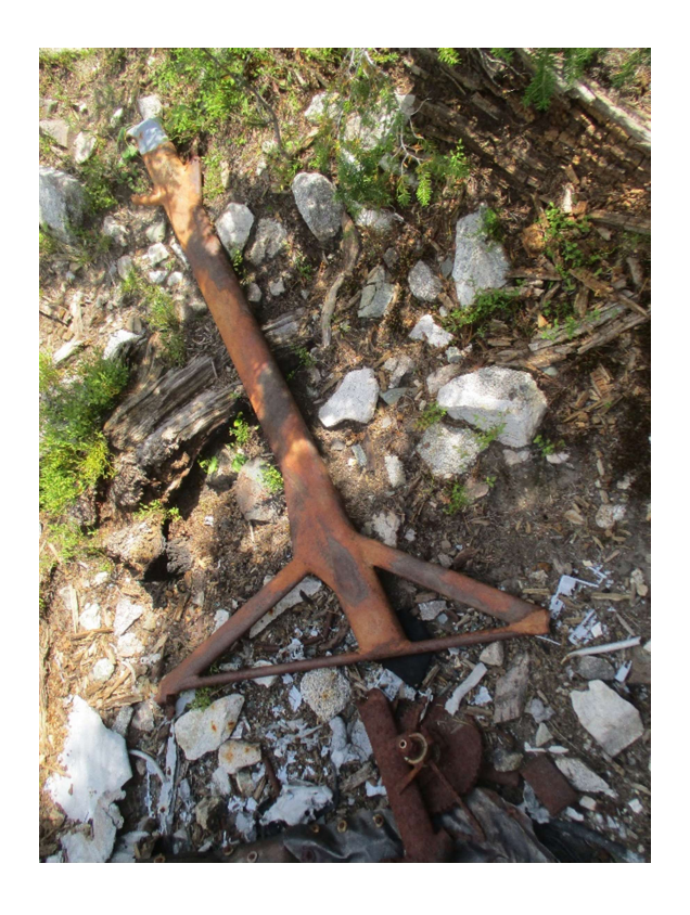
A wing strut