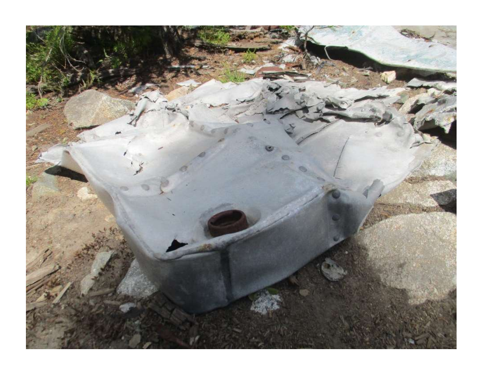
One of the fuel tanks located in the wings