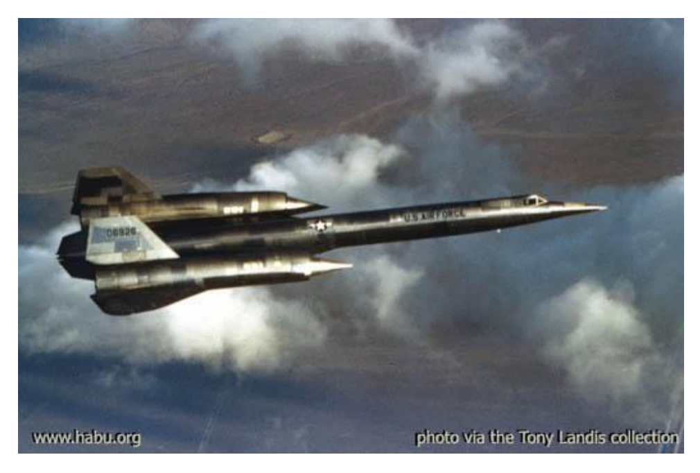
#60-6926 in flight